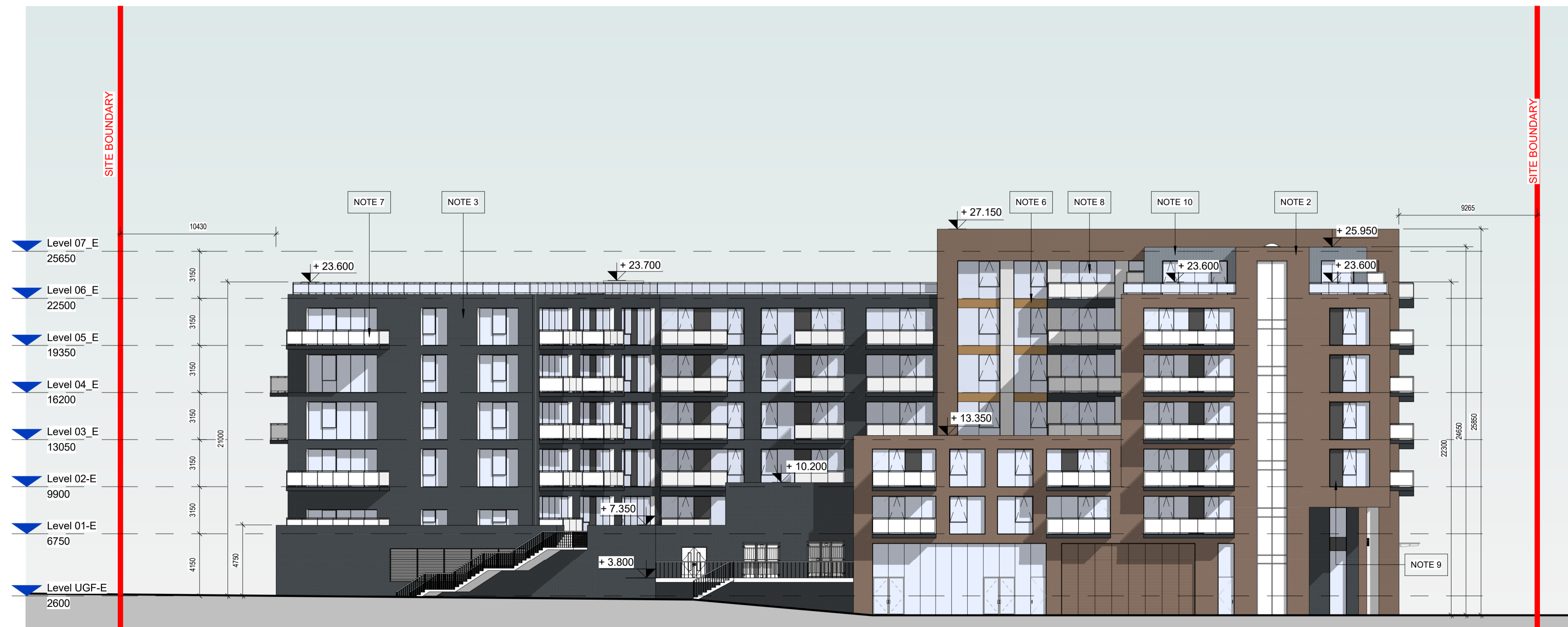
2 BLOCK E-WEST ELEVATION