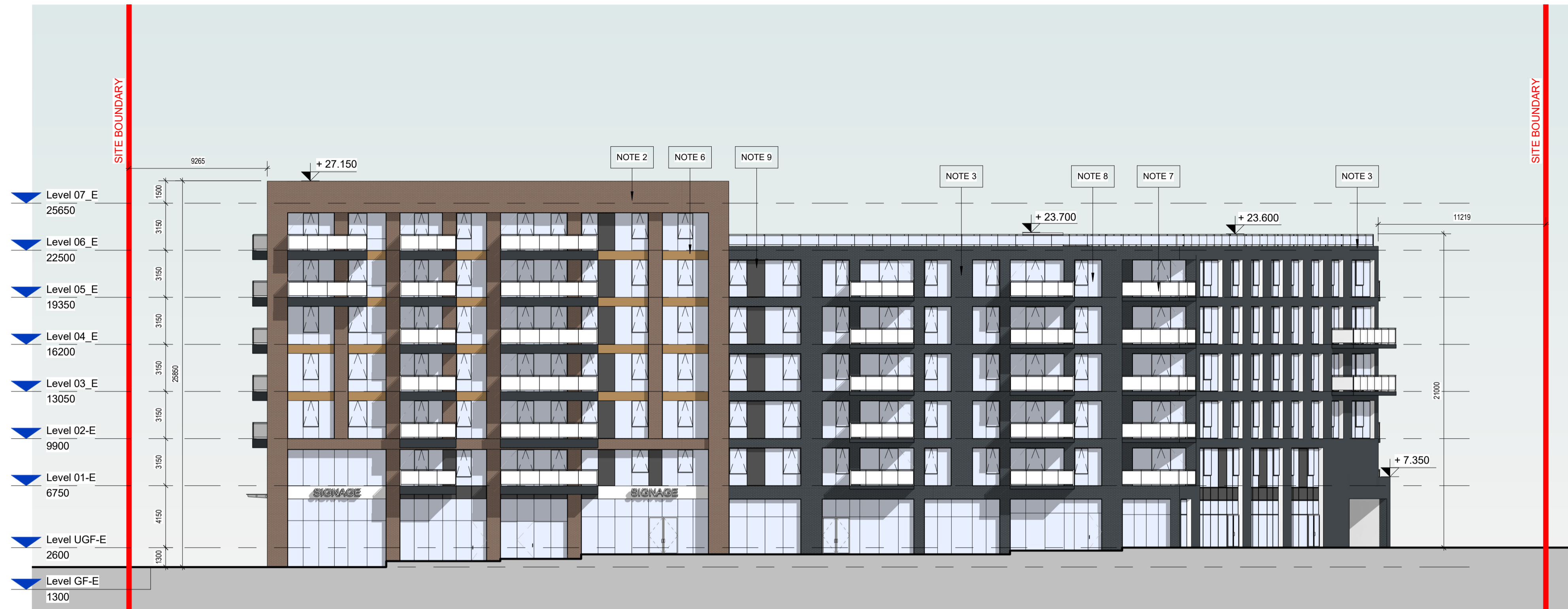
1 BLOCK E-EAST ELEVATION